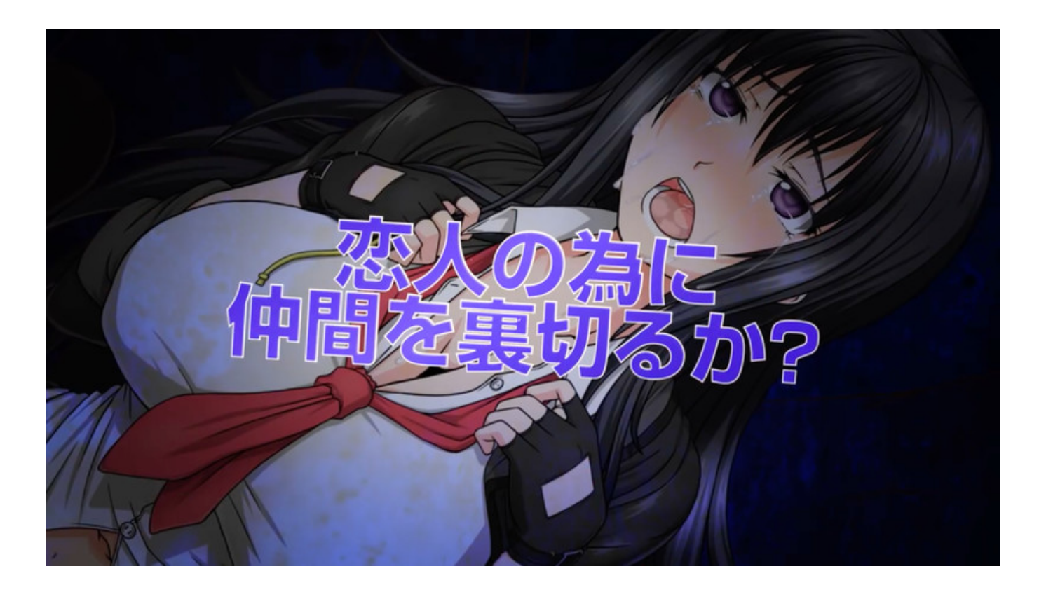
Ruin City Gasolina Activation Code [Crack Serial Key